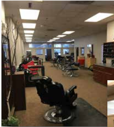
1930 George St Suite A